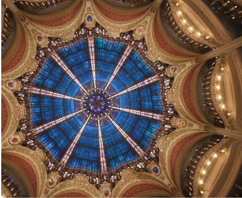
Photography © AIK-Yann Kersalé